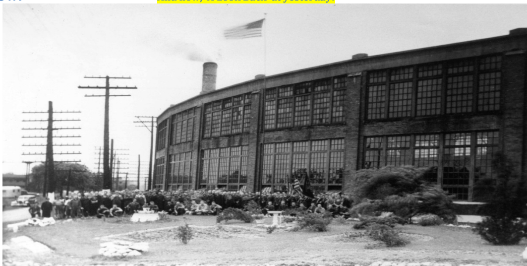
With American Flag and coal smoke blowing in a strong wind, the shop men at the Crestline roundhouse are gathered outside the north end of the huge 30 stall engine house for a special ceremony. The PRR's engine house was in full operation in this circa 1940's exposure.